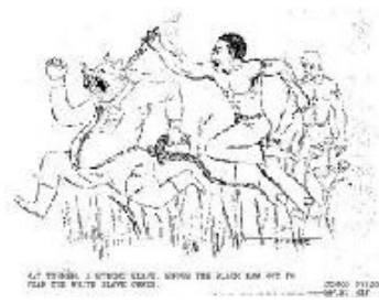
Click for full size picture. (12K)